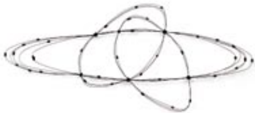
above: CODED SEQUENCE 3, 2003 Steel wire 52 x 24 x 3 inches