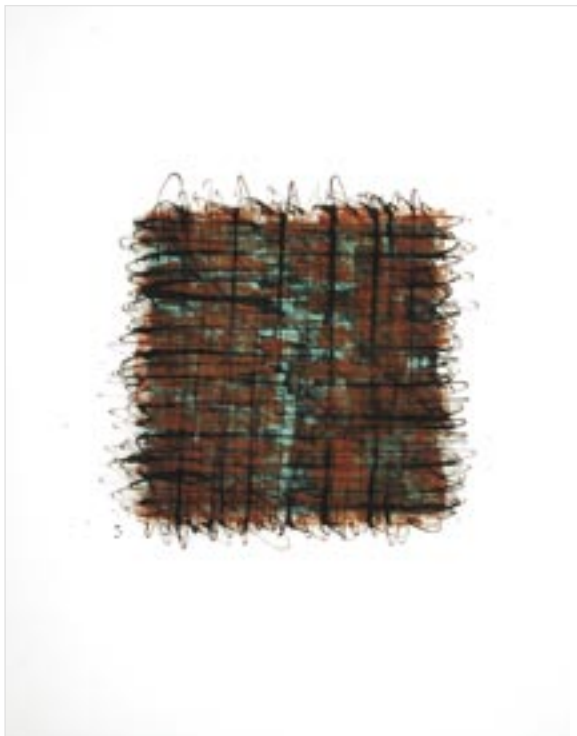
above: INTERACTION WITH OTHERS, 2003 Acrylic on mylar 23 x 18 inches